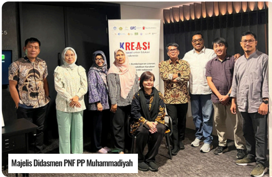
Majelis Didasmen PNF PP Muhammadiyah