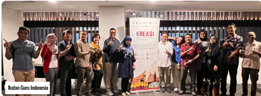
Ikatan Guru Indonesia