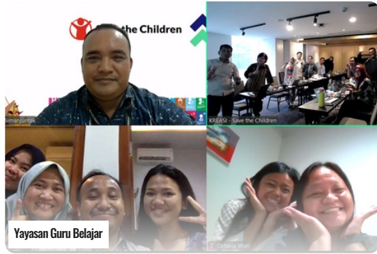
Yayasan Guru Belajar