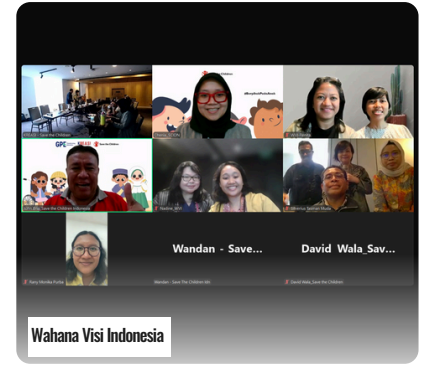
Wahana Visi Indonesia

For seven days (May 6–9, 13–14, and 19, 2025), KREASI held its First Quarter Partnership Review Meeting with seven partners from KREASI's eight intervention districts.