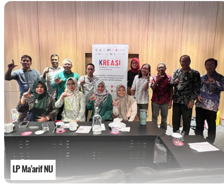
LP Ma'arif NU